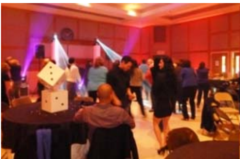
Lots of dancing...

If you weren't able to be there this year, you'll have another chance next year!