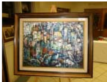
Original oil painting sold at silent auction